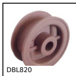
DBL820 Idler for slat top chain, Ranges 820 and 815