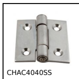
CHAC4040SS Square hinge with riveted pin, drilled,