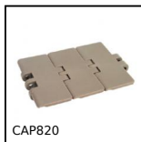
CAP820 Slim slat top chain acetel, Narrow straight range 820