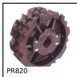
PR820 Idler sprocket for slat top chain, Rangs 820 and 815