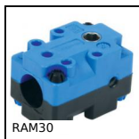
RAM30 Manual bevel gearbox, Bevel