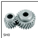
SH0 Parallel axis helical gear, Steel 20NCD2