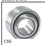
CSS Spherical bushing, Steel / self lubricating