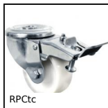
RPCtc Swivel castor with central hole, Steel - Polyamide - with double brake