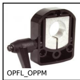
OPFL_OPPM Numerical counter accessories, Locking clamp