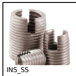
INS_SS Self tapping stainless steel insert, 316 stainless steel