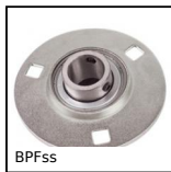
BPFss Pressed stainless steel flange bearing, Stainless steel