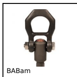
BABam Self-locking ball pin lifting ring for threaded hole, Self-