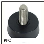
PFC Fixed rubber levelling foot, Levelling support for small parts