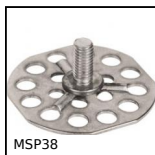
MSP38 Masterplate® glueable insert Ø38, Cylindrical Ø38 with threaded s...