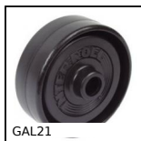
GAL21 Conveyor wheel, Plastic