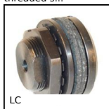
LC Friction clutch, 190 to 1800 Nm