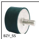
BZY_SS Stainless steel cylindrical elasto mount, Stainless steel