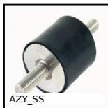
AZY_SS Stainless steel cylindrical elasto mount, Stainless steel