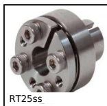
RT25ss Self-centering flanged locking assembly, Medium/high torque