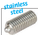
Stainless steel body and pin