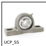
UCP_SS Stainless steel pillow block bearing,