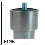
PTMR Telescopic furniture foot, threaded stud