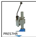
PRES7HR Manual workbench press, Force up to 700kg