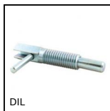
DIL Lever operated locking bolt, lever clamp