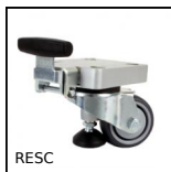
RESC Retractable castor for aluminium profile, Retractable castor