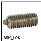
BSM_LOK Long-Lok spring plunger with internal hexagonal socket, LONG-LOK - s...