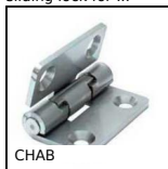
CHAB Hinge with stop, Hinge