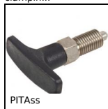
PITAss Locking bolt, with T handle