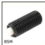
BSM Spring plunger with internal hexagonal socket, steel body, plastic pin