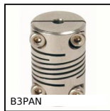
B3PAN Panamech, Multi-Beam stainless steel, Stainless steel - with clampin...