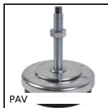
PAV Fixed anti-vibration foot mount, Vibration-dampening