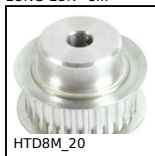
HTD8M_20 HTD Heavy duty timing pulley, HTD8 Steel