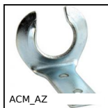
ACM_AZ Mounting bracket for bonnet fastener, Hook