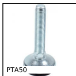
PTA50 Articulated levelling foot, pressed base Ø50, Ø 50