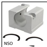
NSO Housing for open linear bearing, Opened - long