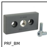
PRF_BM Base support plate for aluminium profile, Central base fixation