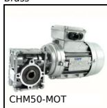
CHM50-MOT Asynchronous AC motorgearboxes 0.18 to 0.75kW, 0.18 to 0.75kW