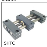
SHTC Drylin® Linear table, Maintenance free