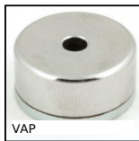
VAP Magnetic stud with central hole, With central hole