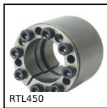
RTL450 Self-centering locking assembly, High torque