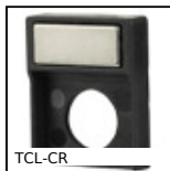
T-Clip - Aluminium profile attachment, Magnetic object holder