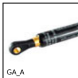
Gas spring, Steel