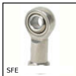
Rod end, Stainless steel / PTFE