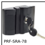
Closing system, Quick fitting, self locking door lock