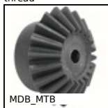
Moulded plastic bevel gear (nylon), 3:1