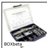
Dowel pin, Boxed set - hitch