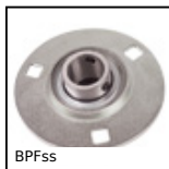
Flange bearing, Stainless steel