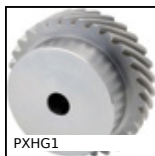
Crossed helical gear - precision range, 20NCD2 case