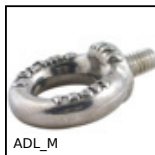
Eye bolt, Stainless steel