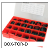
Box set of Nitrile O-rings, 18.00 x 2.00mm to 50.00 x