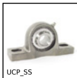
Pillow block, Stainless steel