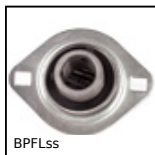
Flange bearing, Stainless steel