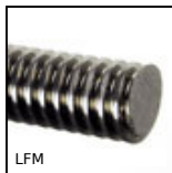
Trapezoidal rolled leadscrew, Medium carbon steel - 1 thread