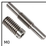
M0 Worm and wheel set, Unhardened steel