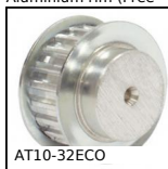
AT10-32ECO AT type timing pulley, Economy range - AT10 aluminium