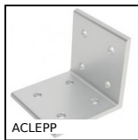
ACLEPP Right angled bracket for aluminium profile, 8 holes