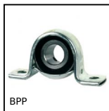
BPP Pressed steel flanged bearing for light loads, Sheet steel