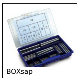
BOXsap Boxed set of spring pins ISO8752, Boxed set - Split ISO 8752