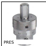
PRES Manual workbench press accessory with PRES-3HR end PRES-4HR, Micromet...