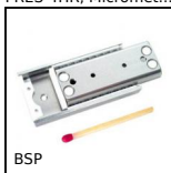
BSP Compact precision slide, from 156 N to 980 N