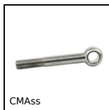
CMAss Eye bolt stainless steel, Stainless steel