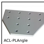
ACL-PLAngle Joining plate for aluminium profile, Angle connection