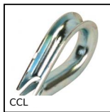
CCL Standard wire thimble, Steel