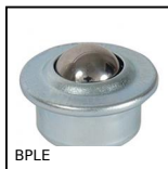
BPLe Ball transfer unit push fit, Light