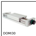
DOMI30 Domino 30 adjustable slide, Slide DOMILINE 30 with counter and handw...