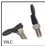
DILC Indexing plunger with cam, with cam