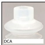
DCA Suction cup, 1.5 bellows, silicon