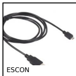
ESCON Speed controller 5A accessories, USB cable for PC link