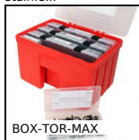
BOX-TOR-MAX Box set of Nitrile O-rings in nitrile, 2.90 x 1.78mm to 82.14 x 3.53