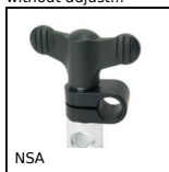
NSA Adjustable clamp, Articulated