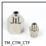
TM_CTM_CTF Suction cup threaded insert, Insert for suction cup - Tread click-in