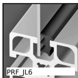
PRF JL6 Lip seal for panel, Door seal - Ø 6mm