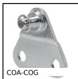
COA-COG Surface mounting plate, Surface mounting plate for clevis