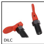
DILC Indexing plunger with cam, with cam