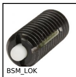
BSM_LOK Long-Lok spring plunger with internal hexagonal socket,