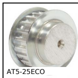
AT5-25ECO AT type timing pulley, Economy range - AT5 aluminium