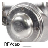
RFVcap Stainless steel protective cover, Closed protective cover