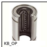
KB_OP Open precision linear bearing, Precision - steel