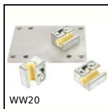
WW20 Drylin® W slide, slide assembly