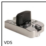
VDS Sliding lock adjustment system, Sliding lock for oblong hole