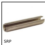
SRP Slotted spring pin ISO8752, Split ISO