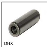
DHX Dowel pin internal thread, Extractable DIN 7979D