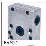
RVM14 Manual worm and wheel gearbox,