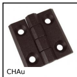
CHAu Screwed hinge, 270°