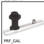
PRF_GAL Roller for aluminium profile, Fixing kit for roller eccentric