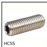
HCSS Set screw with hexagonal socket,