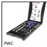
PWC Powercoil thread inserts, Kit Powercoil - with or without insertion ...