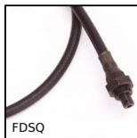
FDSQ Flexible drive shaft, Masterflex® Steel, with PVC casing