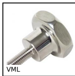
VML Stainless steel hexagonal headed thumb screw, Male