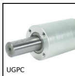
UGPC Actuator guide kit, Short bearing