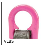
VLBS Folding lifting ring for welding, Folding - for