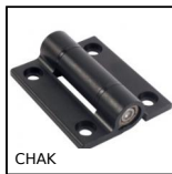
CHAK Hi-Klik™ indent hinge, Hi-Klik™ - Detent hinge