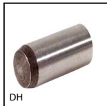
DH Dowel pin, Solid DIN 6325