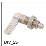
DIV_SS Stainless steel locking bolt, With grip -