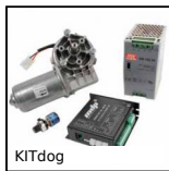
KITdog 24V DC motorisation kit, Worm and wheel