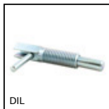
DIL Indexing plunger, lever clamp