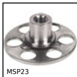
MSP23 Masterplate® glueable insert, Cylindrical Ø23 with threaded stud