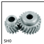
SH0 Parallel axis helical gear, Steel 20NCD2