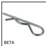
BETA Spring pin, Hitch