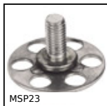
MSP23 Masterplate® glueable insert, Cylindrical Ø23 with threaded stud