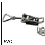
SVG Adjustable latch clamp with catch- plate, Stroke from 106,7mm to 121,4mm