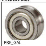
PRF_GAL Roller for aluminium profile, Hollow roller Ø12