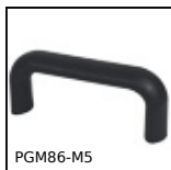
PGM86-M5 Carrying handle, Thermoplastic