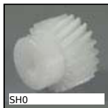
SH0 Parallel axis helical gear, Machined plastic (delrin)