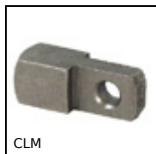
CLM Male clevis end, Steel short