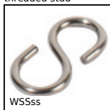
WSSss Symmetrical S shaped hook, Stainless steel