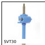
SVT30 Screwjack, with translating screw