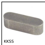
KKSS Rounded end feather key, Stainless steel