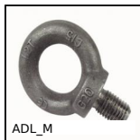
ADL_M Male eye bolt conforms to DIN580, Steel