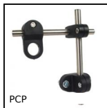
PCP Cell carrier assembly, Ready assembled