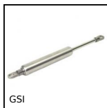
GSI Stainless steel gas spring, Stainless steel