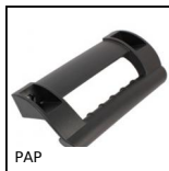
PAP Handle for aluminium profile, Ergonomic handle