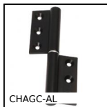
CHAGC-AL Screw-in garnet hinge, Screw-on