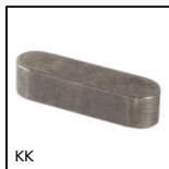
KK Rounded end feather key, Steel