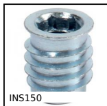
INS150 Self tapping insert with collar-coarse thread, With collar-coarse t...