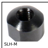
SLH-M Nut for toggle clamp, Round ended nut for SLH/SLV clamp