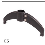
ES Simple support base (bipod), Plastic