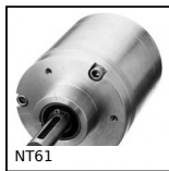
NT61 Spur gear coaxial gearbox, from 5 to 14 Nm - In-line