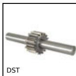
DST Pinion shaft, Stainless steel 303