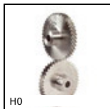
H0 90° crossed axis helical gear, Steel 20NCD2