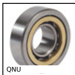
QNU Single row cylindrical roller bearing, Free inner ring