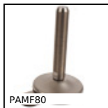
PAMF80 Articulated fixable foot with pressed base, Ø 80