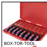
BOX-TOR-TOOL Box set of Nitrile O- rings, Extraction tools