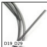
D19 D29 Compression spring, by the metre