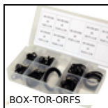
BOX-TOR-ORFS Box set of Nitrile O- rings, 7.65 x 1.78mm to 37.82 x 1.78