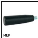
MEP Cylindrical revolving handle, Fixed