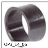
OP3_14_06 Numerical counter accessories, Reduction socket