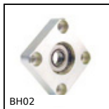
BH02 Flange with bearing, Bearing secured with circlips