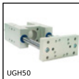
UGH50 H Type Guide units, For Ø50 actuators