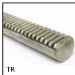
TR Round spur rack, Stainless steel - module 0,25-1,5