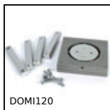
DOMI120 DOMILINE - Accessories, Turntable