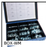
BOX-WM Washer - DIN 125, Box set of steel washers