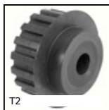
T2 Synchronous pulley, T2.5 moulded plastic (nylon)