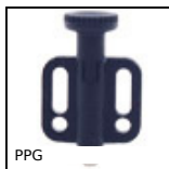
PPG Indexing plunger, With horizontal mounting flange