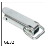
GE32 Sprung toggle latch with connecting link, Standard