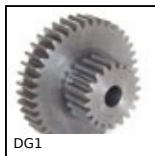
DG1 Double spur gear, Steel 20NCD2