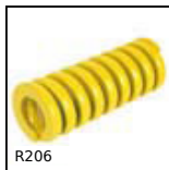
R206 Extra-thick die spring, Extra-heavy