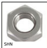
SHN Six-sided nut - DIN 934, Steel (Class 6|8)