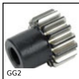
GG2 Ground spur gear, Heat treated steel