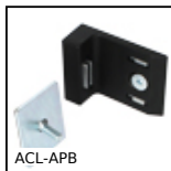
ACL-APB Closing system, Magnetic door stop