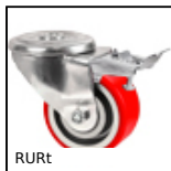
RURt Wheel pivoting with central hole, Polyurethane - Aluminium rim (Free