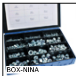
BOX-NINA Self locking nut - DIN 985, Box set of steel nuts