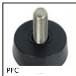
PFC Fixed foot, Levelling support for small parts