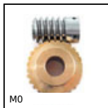
M0 Wheel, Bronze