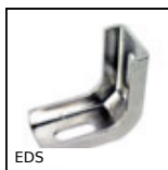
EDS Support component, 90° angle bracket