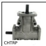
CHTRP Single and dual output gearboxes, Up to 9,1 Nm