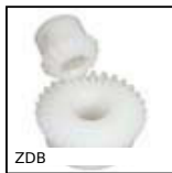
ZDB Machined plastic bevel gear (delrin), 2:1