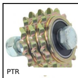
PTR Idler chain sprocket, For standard