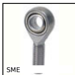
SME Rod end, Stainless steel / PTFE