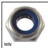
NIN Self locking nut - DIN 985, Steel