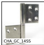
CHA_GC_1455 Stainless steel garnet hinge, To screw