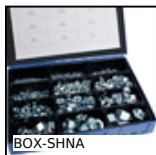
BOX-SHNA Six-sided nut - DIN 934, Box set of steel nuts