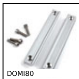
DOMI80 DOMILINE - Accessories, Fixing kit