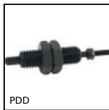
PDD Spring operated plunger, Non-rotating detector shaft