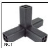
NCT Square tube connector, Fixed angle