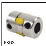
EKGS Backlash free coupling Gerwah®, from 0.5 to 35Nm