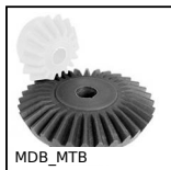
MDB_MTB Moulded plastic bevel gear (nylon), 2:1