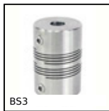
BS3 Panamech, Multi-Beam, Stainless steel - with set screw