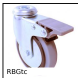
RBGtc Swivel castor with central hole, Steel -