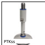
PTKss Foot for the food industry, Stainless steel - 3-A standard