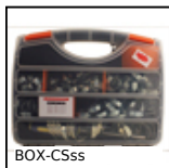
BOX-CSss Hose clamp, Box set of stainless steel hose clamps