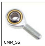
CMM_SS Rod end, Stainless steel / bronze - Economy range