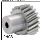
PHG3 Parallel axis helical gear - Precision range, 35NCD6 Pre-hardened