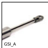
GSI_A Gas spring, Stainless steel