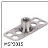
MSP3815 Masterplate® glueable insert, rectangular with tapped insert