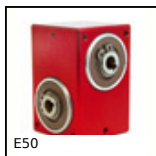
E50 Angle transmission gearbox, from 3 to 41 Nm