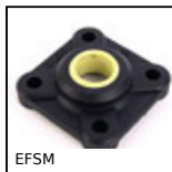
EFSM Flange bearing, Polymer