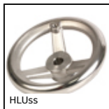
HLUss Hand wheel, Stainless steel 316