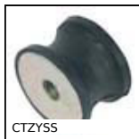
CTZYSS Anti vibration mount, Stainless steel