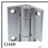
CHAR Spring hinges, screwed