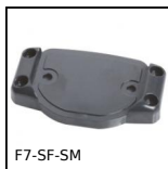
Multifunction display, Mounting bracket for