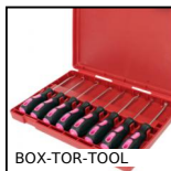
Box set of tool for Nitrile O-rings, Extraction tools