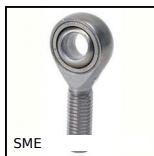
Male rod ends , Stainless steel / PTFE