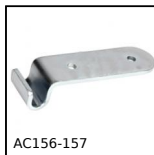
Strike for toggle latch, 25.5mm