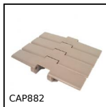
Flexible slat top chain acetal, Large range 882