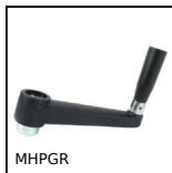
Arm with folding rotating handle,