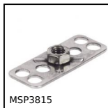
MSP3815 Masterplate® glueable insert rectangular, rectangular with nut