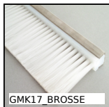
GMK17_BROSSE Brush strip, Cone- shaped - brush