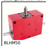
BLHM50 Right angled gearbox, double output shafts, up to 30 Nm