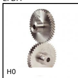
H0 Crossed helical gear crossed axis at 90°, stainless steel