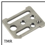
TMR Rigid manual tensioner, Adjustable