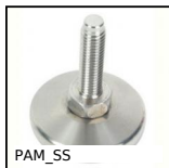
PAM_SS Stainless steel articulated levelling foot, Ø 30 & 40