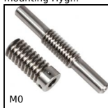
M0 Worm and wheel set, Non hardened steel