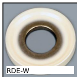
RDE-W Sealing washer Hygienic Usit®, Stainless steel - White EPDM