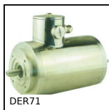
DER71 Stainless steel AC asynchronous motor 0.25 à 0.37kW, 0.25 to 0.37kW