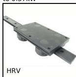
HRV V- rail guidance Simple Select® system, Rail with carriage