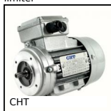
CHT Asynchronous AC Motor, 0.18 to 0.55kW