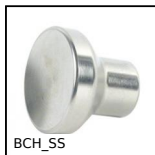
BCH_SS Mushroom headed button, M3 to M8