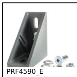
Bracket for aluminium profile, PRF4590