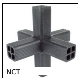
Square tube connector, Fixed angle