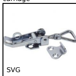
SVG Adjustable latch clamp with strike plate, Stroke with 82mm to 92mm