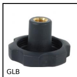
Small 6 lobe threaded handle - female, Technopolymer - Brass