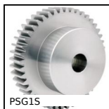
Spur gear - precision range, Stainless steel 316