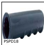
Flexible tube handle, Black PVC