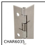
Spring hinge, screwed/welded