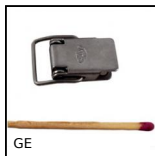
GE Toggle latches, Miniature