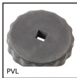
PVL Small lobed handle, Polyamide