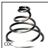
CDC Conical compression spring, Conical