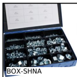
Hexagonal nut - DIN934, Box set of steel nuts