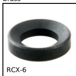
Spherical tilt washer - DIN6319, concave