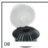
Steel bevel gear, 2:1