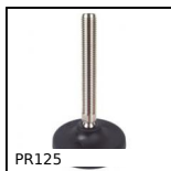
Articulated foot Ø123, Ø 123