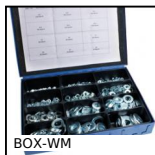
Box set of washer - DIN125, Box set of steel washers