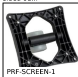
PRF-SCREEN-1 Screen support, Basic support