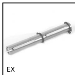
EX Optional shaft for E-type gear reducers, E Gearboxes single sided out...