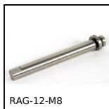
RAG-12-M8 Roller guide accessory, Anchoring system