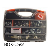
BOX-CSss Hose clamp, Box set of stainless steel hose clamps