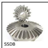
Stainless steel bevel gear, 2:1