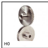
Crossed helical gear crossed axis at 90°, Steel 20NCD2