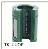
Topball self-aligning linear bearing, Topball self-aligning