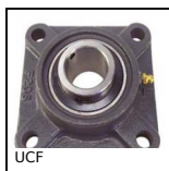
Cast iron flange bearing unit, Cast iron