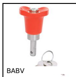
Ball lock pins lockable , Stainless steel