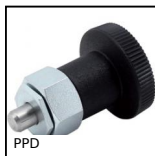
Indexing plunger for sheets, For sheet metal