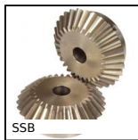
Stainless steel bevel gear, 1:1