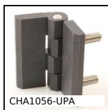
Molded polyamide face-mounted hinge,