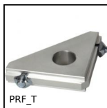
Corner reinforcement, Corner reinforcement