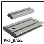
PRF_BASE Base plate for aluminium profile, Base plate