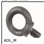
ADL_M Male eye bolt conforms to DIN580, Steel