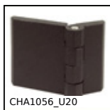
Screw-in hinge, Section 76x50