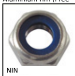
Self locking nut - DIN 985, Steel