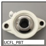
Flange bearing, Polymer and stainless steel