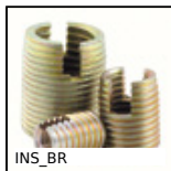
Self tapping insert, Brass