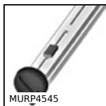
Mini profile-mounted adjusting unit, 45x45mm