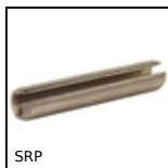
Spring pin, Split ISO 8752