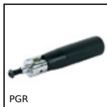
Cylindrical revolving handle, Folding