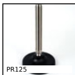
Fixable articulated foot - polyamide, Ø 123