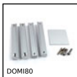
DOMILINE - Accessories, Plate