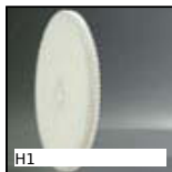
90° crossed axis helical gear, Machined plastic (delrin)