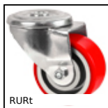
Wheel pivoting with central hole, Polyurethane - Aluminium rim (Free