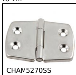
CHAM5270SS Marine hinge for welding/screw mounting, Marine