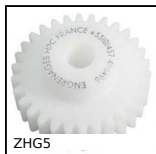
ZHG5 Plastic spur gear, Machined plastic (delrin)