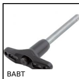
BABT Hardened Stainless steel ball pin, Hardened stainless steel