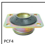
PCF4 Conical flexible mount, Square base plate