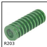
R203 Die spring ISO10243, Light