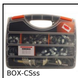
BOX-CS55 Hose clamp, Box set of stainless steel hose clamps