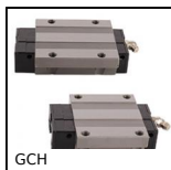
GCH Linear ball slide - Stainless steel balls, Chariot - from 514 N to 1...