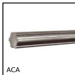
ACA Steel splined shaft, Steel