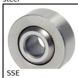
SSE Stainless steel spherical bearing, Stainless steel / PTFE