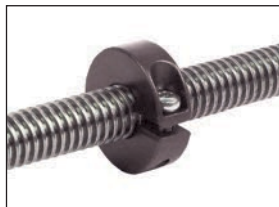
Typical application: fitted to a LFM lead screw