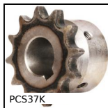
PCS37K Chain sprocket with hardened teeth, 9.525mm (DIN06B-1)