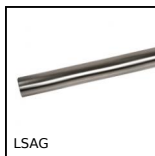
LSAG Precision linear rotary ball spline, Rail - from 514 N to 15386 N