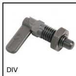
DIV Locking bolt, With grip - Steel