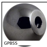
GPBSS Threaded spherical knob, Aluminium