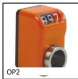
OP2 Mechanical digital position indicator, 3 numbers