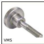
VMS Stainless steel knurled thumb screw, Knurled