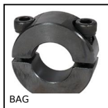
BAG Steel Clamping collar, Steel