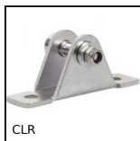
CLR Straight clevis, Straight clevis for use with a male clevis