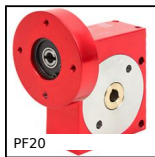
PF20 Worm and wheel gear reducer, up to 5 Nm