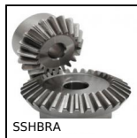
SSHBRA Stainless steel bevel gear, 1,5:1 2:1 3:1