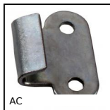
AC Strike for toggle latch, 15mm