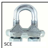
SCE U-shaped cable clamp, Steel