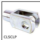
CLSCLP Clevis components, short version, Steel - short range