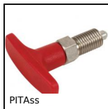
PITAss Locking bolt, with T handle