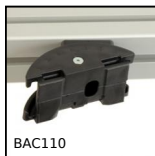
BAC110 Swivel storage bin, Adjustable support