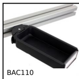
BAC110 Swivel storage bin, Storage bin