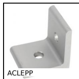
ACLEPP Right angled bracket for aluminium profile, 2 holes