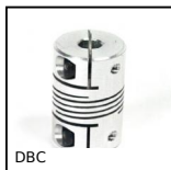
Panamech, Multi-Beam, Aluminium - with clamping jaw