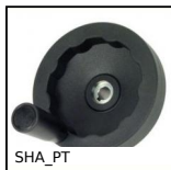
Handwheel with handle, Polyamide