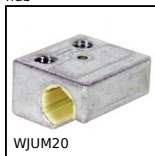
Drylin® W bearing block, Slide