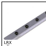
Linear roller slide, Rail - from 9410 N to 101000 N