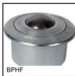
Ball transfer unit push fit, Heavy