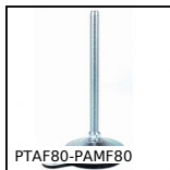
Articulated fixable foot with pressed base Ø80, Ø 80