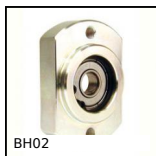
Single housed bearing assembly, Bearing