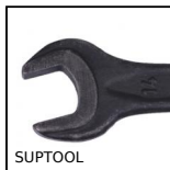
Installation tools for clamping hub, For hexagonal clamping hub