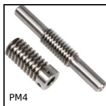
Worm and wheel set, Non hardened steel