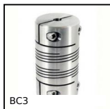
Panamech, Multi-Beam stainless steel, Stainless steel - with clampin...