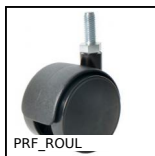
Castor for aluminium profile, No brake