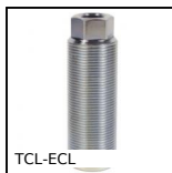
TCL-ECL Support rod for heavy loads, Support spindle