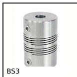
BS3 Panamech, Multi- Beam stainless steel, Stainless steel - with set screw