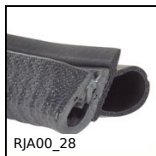
RJA00_28 Sealing strip, Clipping