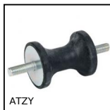
ATZY Diabolo shaped elasto mount, Steel