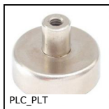
PLC_PLT Magnetic stud with threaded hole, With