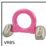
VRBS Folding lifting ring for welding, Folding - for welding