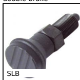
SLB Indexing plunger, steel class 5.8