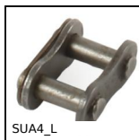
Chain link, Steel