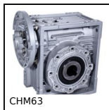
Worm and wheel gear reducer, up to 196 Nm