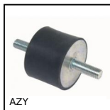
Cylindrical elasto mount, Steel