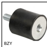
Cylindrical elasto mount, Steel