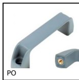
Pull handle - Multi- sector, Tapped recessed insert