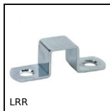
Catch-plate for latch, Catch-plate