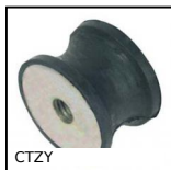
Diabolo shaped elasto mount, Steel