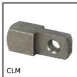
CLM Male clevis end, Steel short