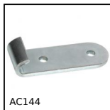
AC144 Strike for toggle latch, 22mm