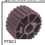
PT821 Drive sprocket for slat top chain, Ranges 821 and 805