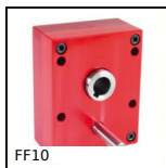
FF10 Offset spur gear reducer, from 0.78 to 3.70 Nm