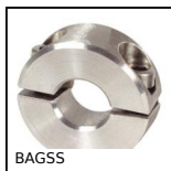
BAGSS Stainless steel Clamping collar,