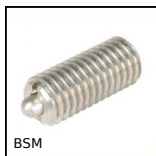
BSM Spring plunger with internal hexagonal