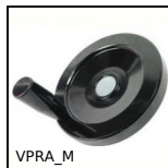
VPRA_M Handwheel with handle, Thermosetting plastic - galvanised steel hub