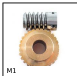
M1 Worm and wheel set, Bronze