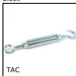
TAC Rigging screw (hook/eye), Steel