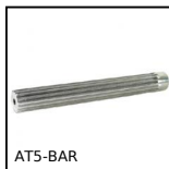
AT type tooth bar stock, AT5