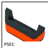
PSEC Security pull handle, Thermoplastic