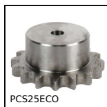
PCS25ECO Chain sprocket - steel, 6.35mm