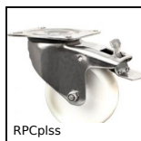
RPCplss Swivel castor with double brake, Stainless steel - Polyamide