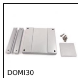
DOMI30 Accessories, Plate