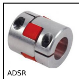
ADSR Backlash free coupling Gerwah® , from 12.5 to 525Nm