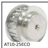
AT type timing pulley, Economy range - AT10 aluminium