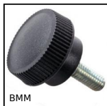
Knurled knob - male, Knurled