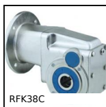
RFK38C Hypoid gearbox - Stainless steel, up to 200 Nm