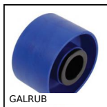
60mm rubber wheel for conveyor belt, Rubber