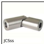
JCSss Single stainless steel universal joint, Low duty