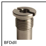
BFDdII Locking pin for bushes, Nickel-plated steel