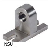
NSU Universal 90° support clamp, Universal 90° support clamp