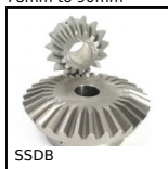
SSDB Stainless steel bevel gear, 2:1