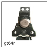
gt64r Rotating bent lever with spring, Increased fitting tolerances