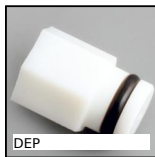
DEP Tools Hygienic Usit® and Hygienic Design®, Protective insert for s...