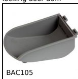
BAC105 Storage bin, 8mm