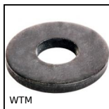
WTM Tightening washer - DIN6340, Steel