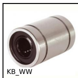
KB_WW Closed linear precision bearing,