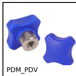
PDM_PDV Detectable plastic palm grip, blue thermoplastic