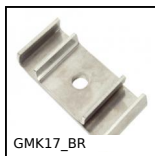
GMK17_BR Clamp for guiding profile, Rounded only