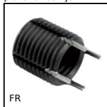
FR Steel thread inserts, Steel