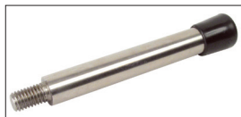
With adjusting rod APB