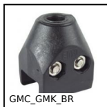
GMC_GMK_BR Guiding profile clamp, Flat or rounded