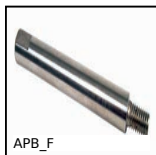
APB_F Adjusting rod for clamp - Male, Threaded