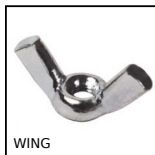
WING Manually tightened wing nut, Steel (ANSI B18-17)