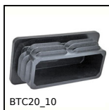
BTC20_10 End cap for rectangular tube, Standard