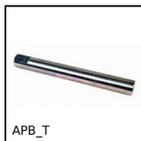
APB_T Adjusting rod for clamp - Female, Bored