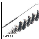
GPLss Brush, stainless steel