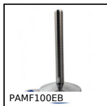
PAMF100EB Articulated foot with sheet metal base Ø100, Articulated foot